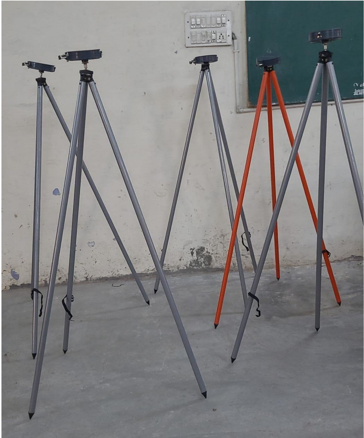
Prismatic Compass (5 No.s)