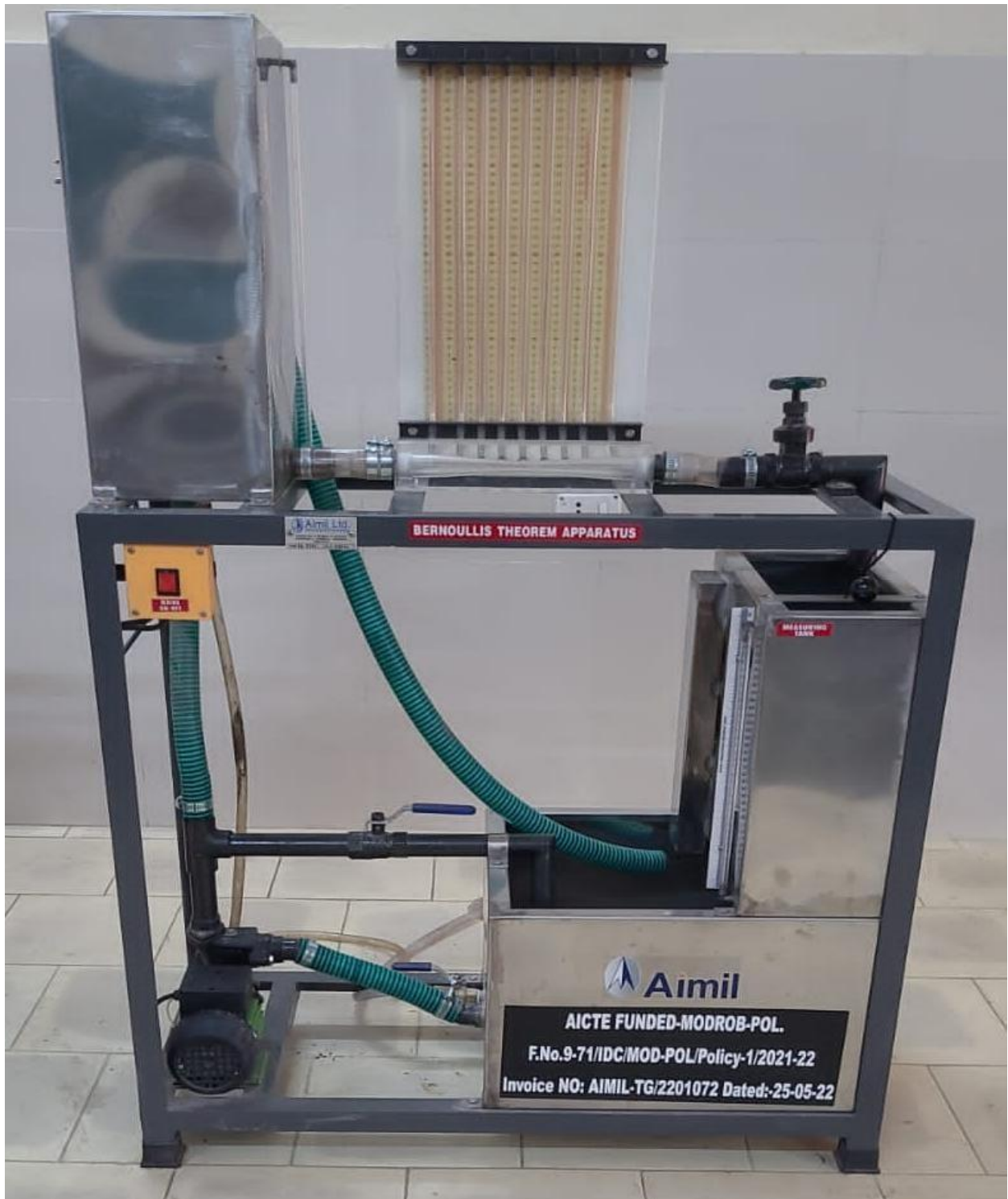
Bernoulli's Theorem Apparatus