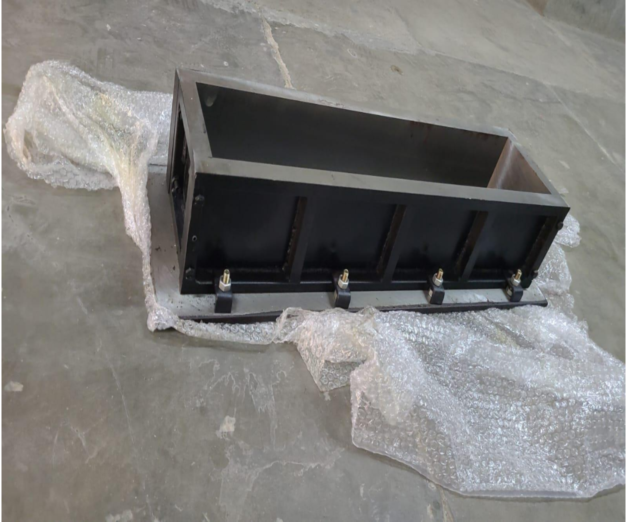
Concrete Beam Moulds (150x150x700mm)