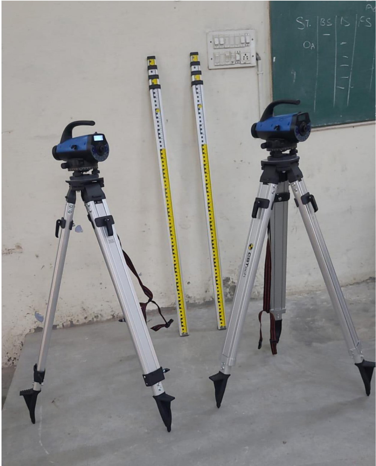
Auto Level (Digital) 2No.s