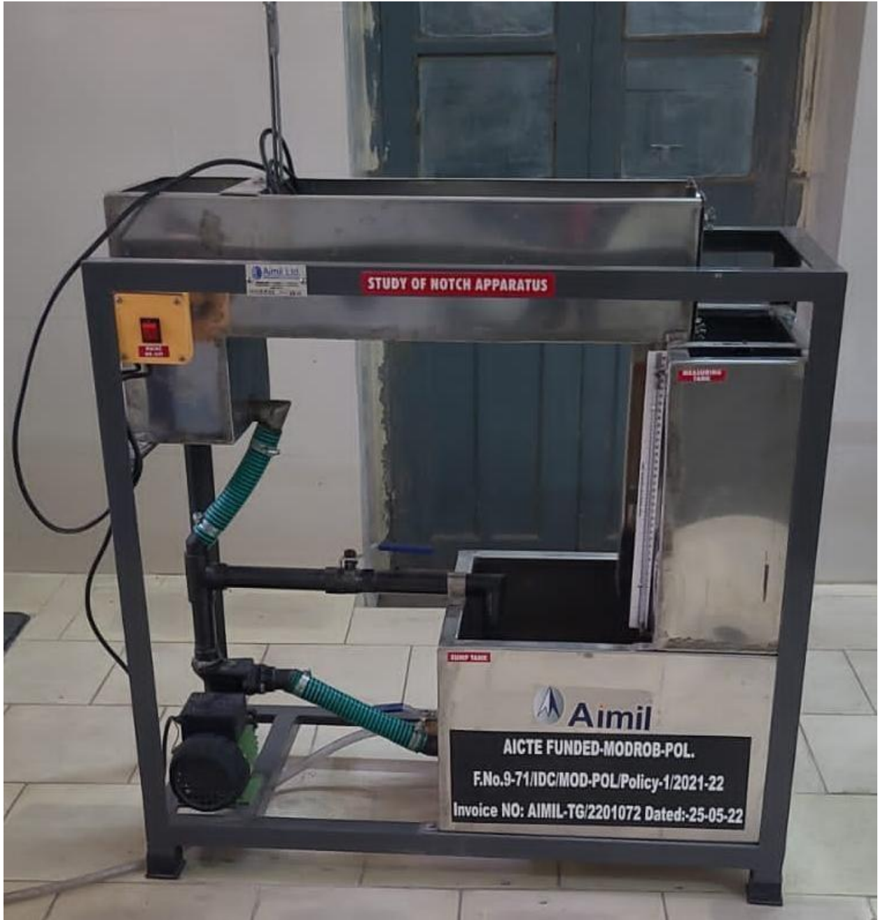
Discharge over Notches Apparatus