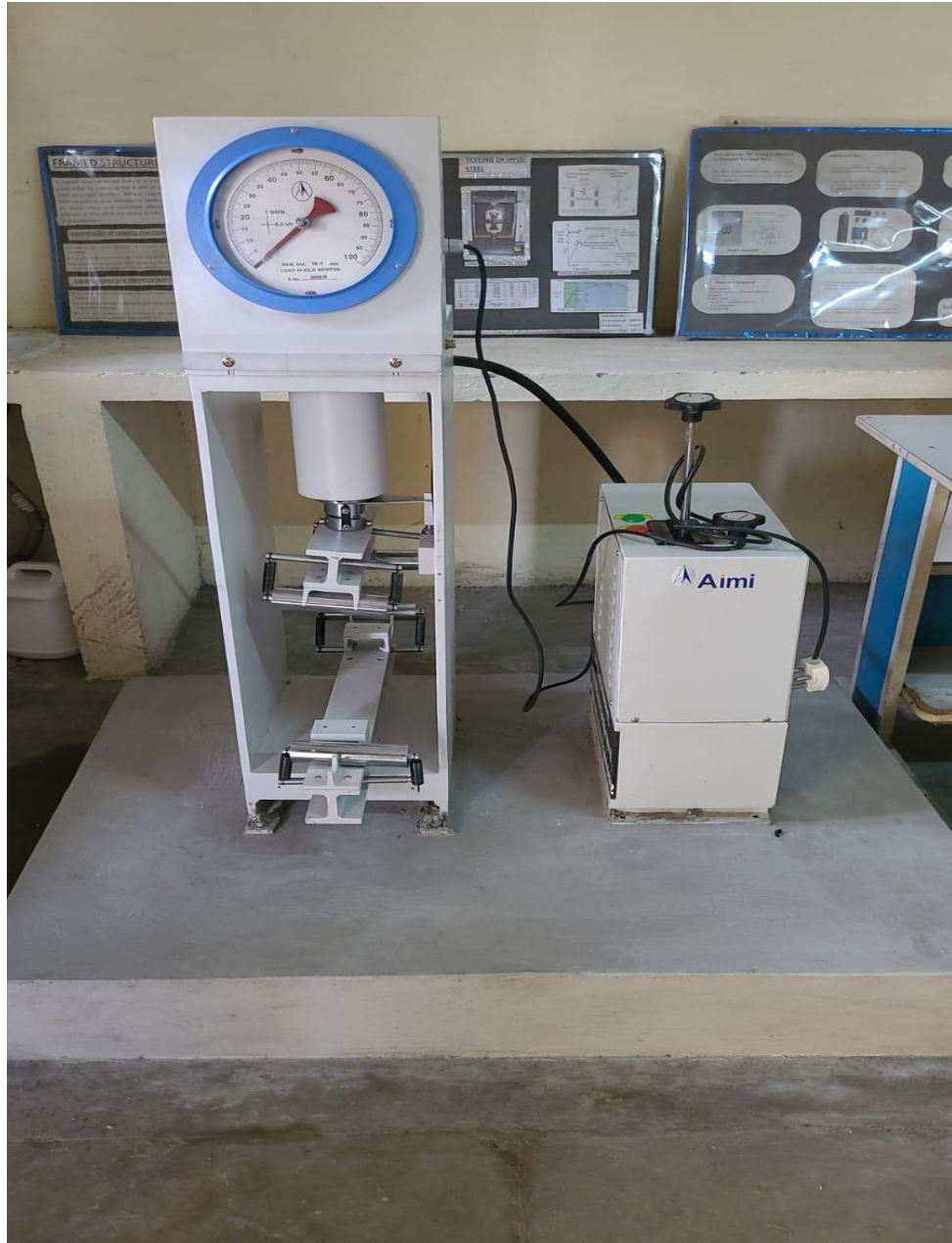
Flexural Strength Testing Machine